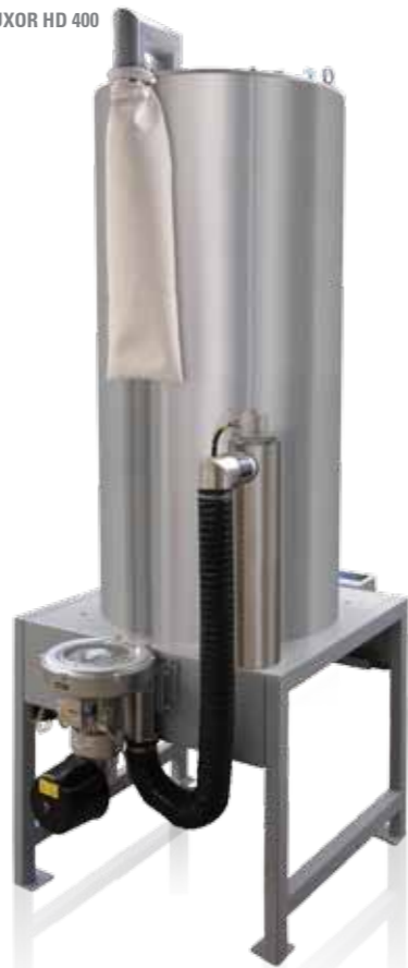
LUXOR HD 400