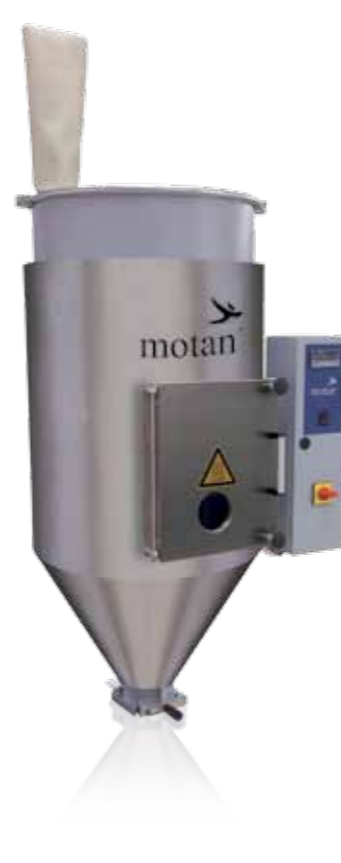
LUXOR HD 150